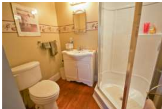
Green Bedroom has 3 piece en-suite. Notice the beautiful plank floors thru-out the 2nd level