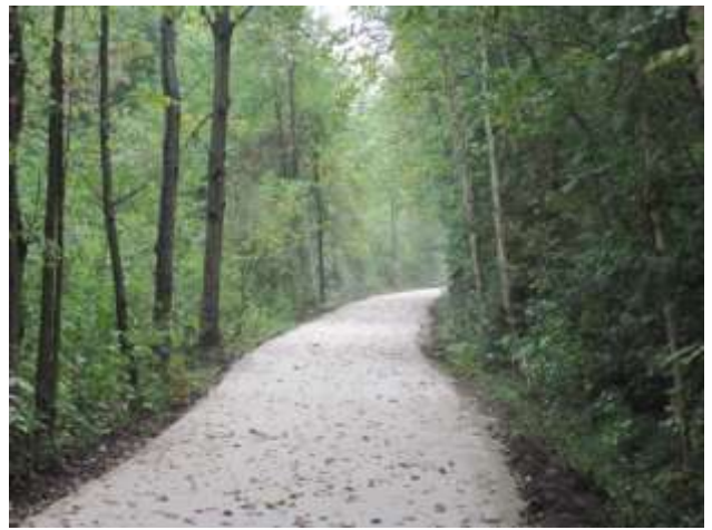
The Caledon Trail is just one of Cheltenham's many charms. The trails allows you to hike, cycle or horseback ride from Terra Cotta to Palgrave—a 35 km stretch with coffee shops & natural sites along the way.